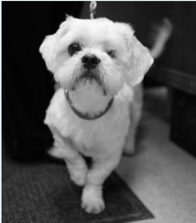
Elliott

To save postage and printing costs, we will not be sending a separate spring appeal. Please make a gift today to keep the PetFix Clinic on the road for animals like Elliott and the good people who love and care for them.